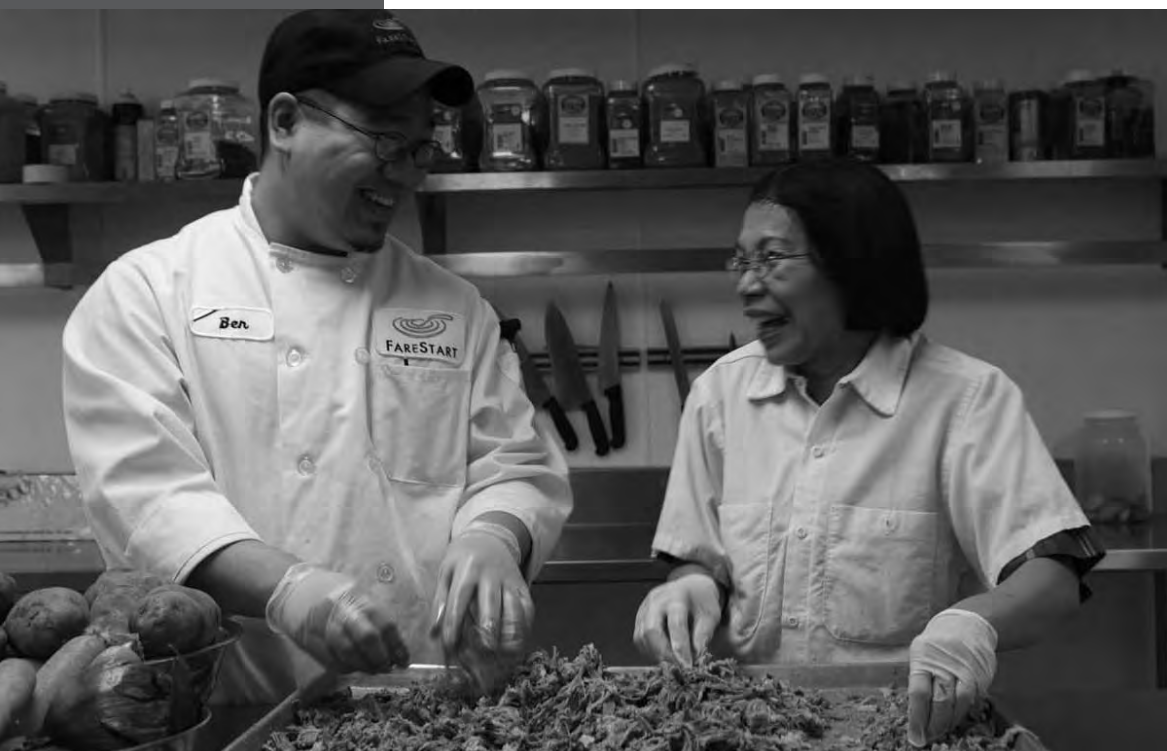
REVENUE (FareStart only)

587,376 total meals served by FareStart staff and students!